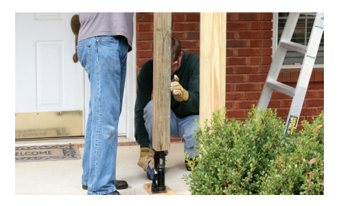
8. After ensuring that the column supports the load and is stable, remove temporary support.