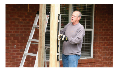
7. Check for plumb.